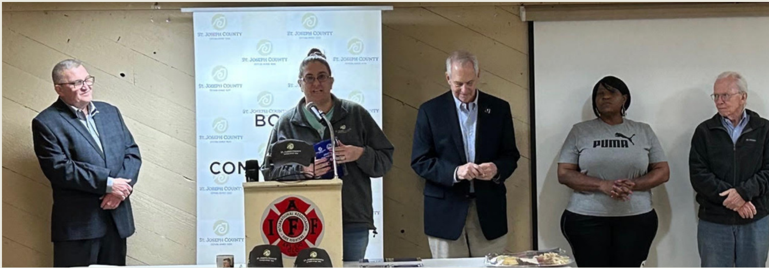
THE ST. JOSEPH COUNTY ARCHIVES TEAM WAS HONORED EARLY THIS YEAR FOR THEIR DILIGENT WORK.

We have upgraded our microfilm reader, to a reader/scanner. This allows us to convert our microfilm to digital images, which we can save in our new system.