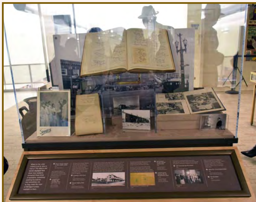
Social Opportunities case featuring a 1924 Marriage Record Book from the Crown Point Community Library collections, a galley proof for Jean Shepard's In God We Trust: All Other Pay Cash , a 1958 Roosevelt High School Yearbook (Gary), and several photographs related to the story of social opportunity.

Join us for all of the Calumet Voices, National Stories exhibitions! Each venue hosts a unique collection of voices and stories. The second installment Calumet: The Land of Opportunity, will be on display at the Gary Public Library