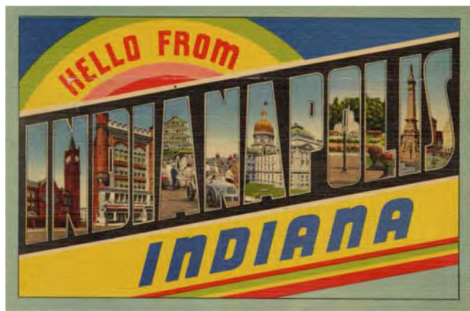
Indianapolis Postcard

Over the past year, the Indiana State Archives implemented a Reddit account to modest success. The session will focus on the Archives successes, failures, and lessons learned in this regard, as well as providing trick and tips for the Archives and archivists that want to use the platform moving forward.