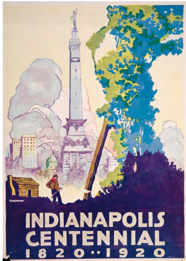
Indianapolis Centennial Broadside, Indiana State Library

In 2018 three Indiana schools applied for the Council of Independent Colleges "Humanities for the Public Good" grant for 2019-2020 and won three of the 25 grants awarded. The grants, in their first year, were created to connect independent colleges with their communities through undergraduate research, highlighting the importance of cultural heritage collections. Undergraduates experienced hands-on research with archival collections, and the challenge of making those collections accessible to the public through outreach and public programming.