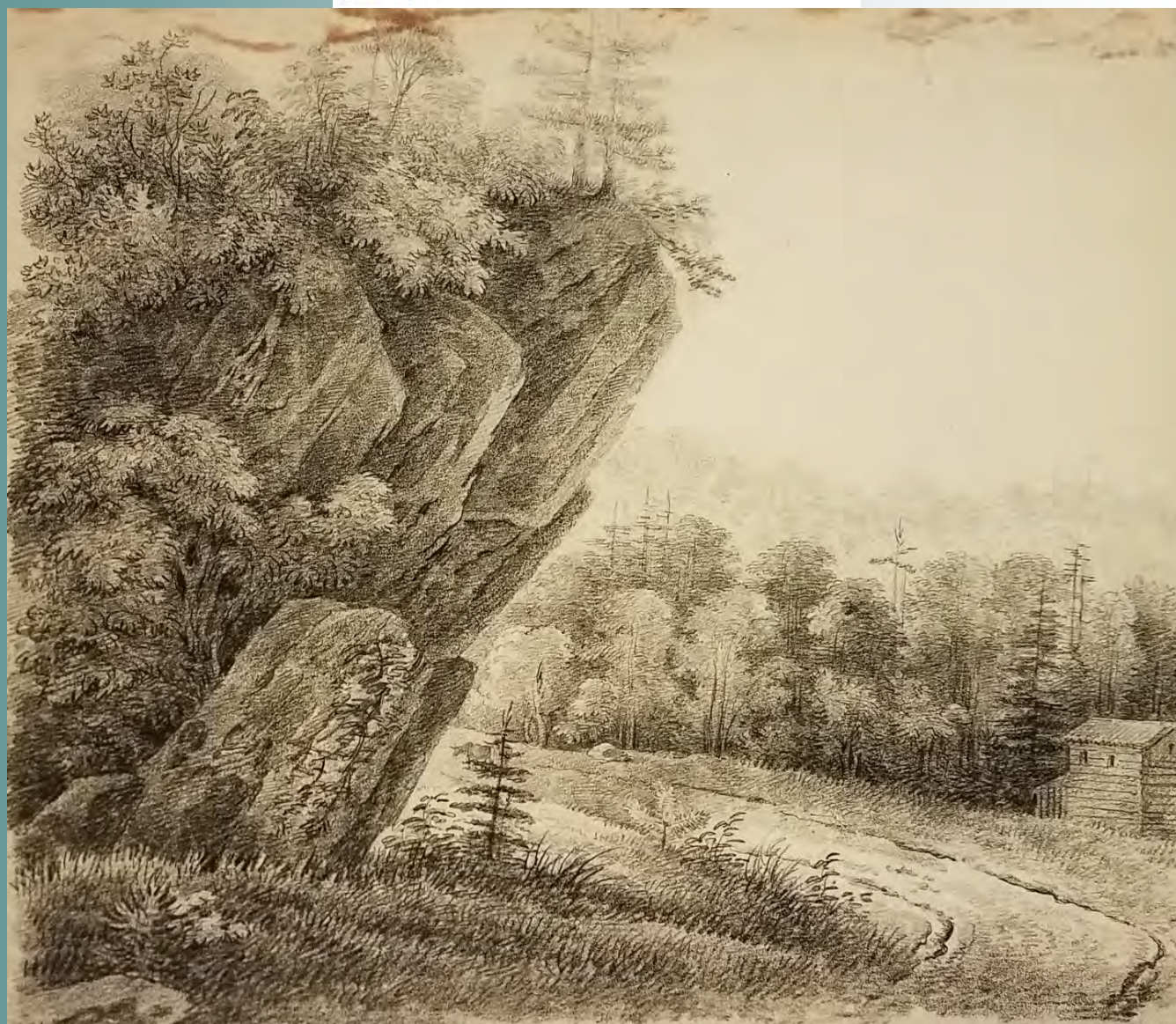
Charles Lesueur Sketches of New Harmony and Southern Indiana More on Lesueur's illustrations on page 6