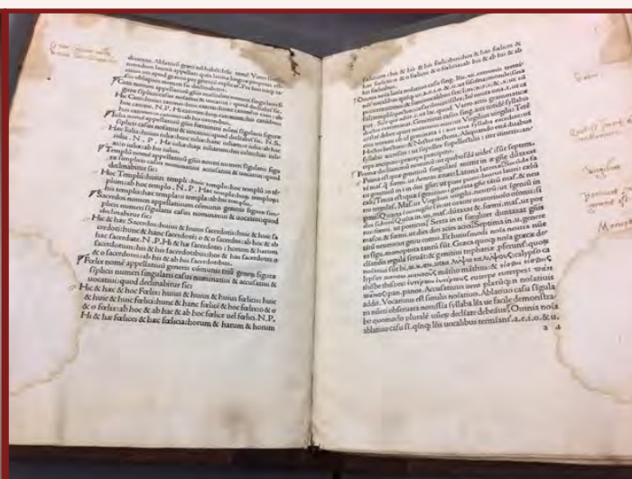
Left: Smallest English Dictionary. Above: Ars Grammatica.