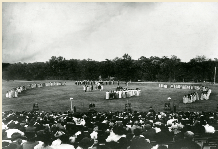
Indiana Centennial Pageant, 1916, Indianapolis.

The historic 990-PF tax form collection, part of the Foundation Center Historical Collection at IUPUI, is one of the few ways to gather systematic information about private foundations from 1971-1997. These documents shed light on the inner workings of private foundations—board composition, compensation, and grants—that are traditionally very difficult to research. Stored on approximately 1.7 million aperture cards with microfilm insets, the forms are full of social security numbers and require mediation for access. Demand has sharply increased as a result of a judge's ruling in late 2014 that the IRS should make all 990s available to the public in machine-readable format. This presentation will illustrate how we're trying to meet the growing demand: how we have made them available electronically, how we're modifying our practices while we seek grant funding to complete digitization of the whole collection, and how we hope to transform these scans into datasets for use by scholars, watchdog groups, and other interested parties.