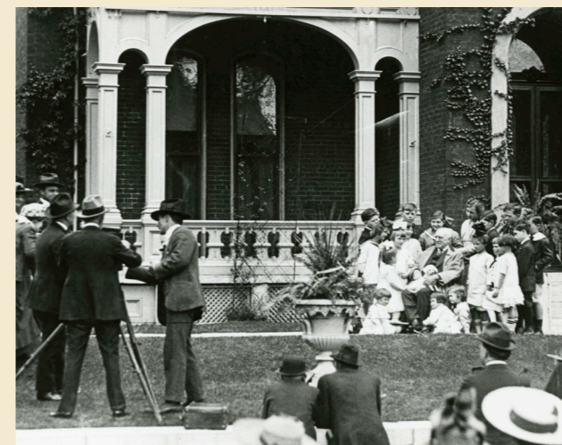
Indiana Centennial Pageant, 1916.