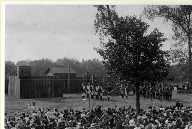
Indiana Centennial Pageant, 1916, Vincennes.

A class of elementary social studies majors create primary source packets, units, and assessment tasks using digital sources such as Indiana Memory in order to create online educational materials for The Farm at Prophetstown, Indiana Memory, Indiana State Forests, and the Monroe County Historic Preservation Review Board. The members of this panel presentation discuss the interaction between archives, creating classroom educational materials, and public application. Each participant describes their needs and the successes and pitfalls in developing those materials and offers suggestions to archives that wish to partner with universities and public schools. The members of the panel demonstrate products that are available online and how archival/educational resources are sustainable after the conclusion of the Indiana bicentennial. Audience members are asked to participate by describing their issues and experiences in working with schools to develop archival/educational projects.