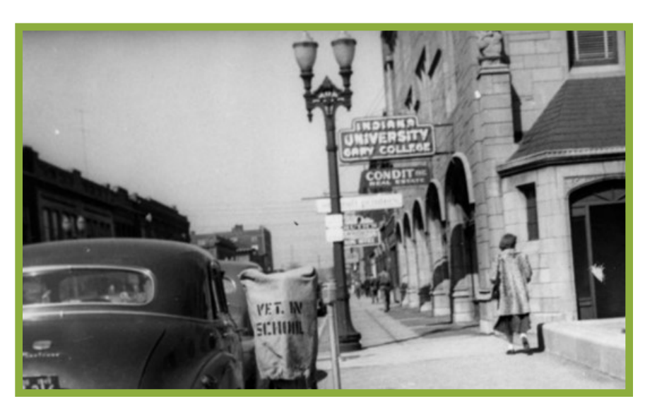
Indiana University Northwest Gary College, North Washington and 6th Ave, 1948.