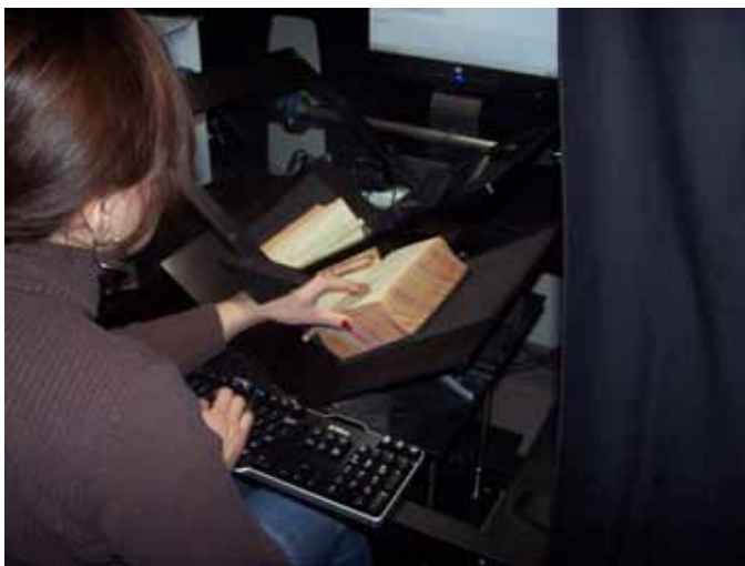
An Internet Archive worker scans images onsite at the Allen County Public Library.