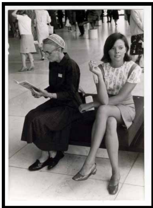
Two Women with Contrasting Dress, Mennonite World Conference, 1967