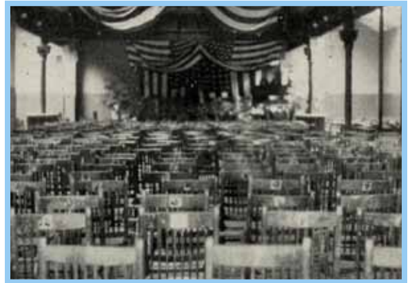
Assembly Hall, Wabash College circa 1902

Please note the original registration form had a mistake on it. The price of the advanced registration for the annual meeting is $35, not $25.