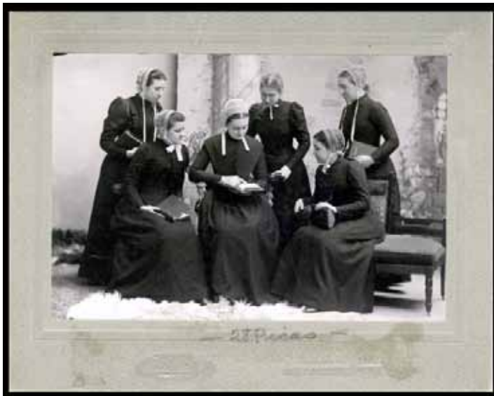
Mennonite Women's Attire, 1903

For more photographs from the Mennonite Church USA Archives go to http://www.flickr.com/photos/mennonite-churchusa-archives/