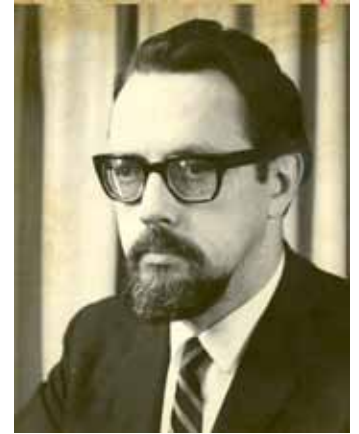
John H. Yoder

ogy Act, administered by the Indiana State Library. The institute is the primary source of federal support for the nation's 123,000 libraries and 17,500 museums. Its mission is to create strong libraries and museums that connect people to information and ideas.