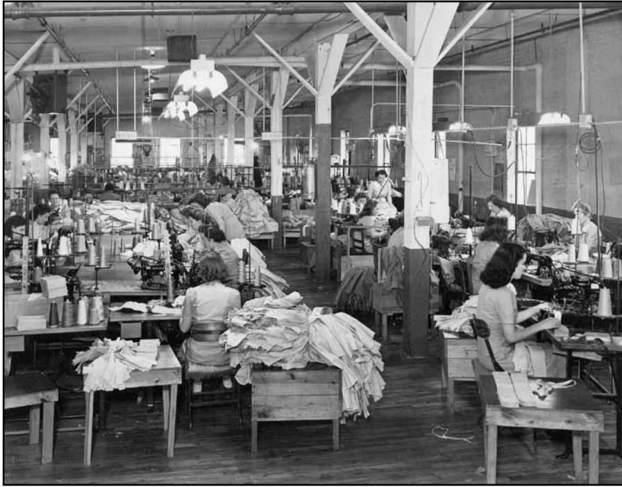
Women sewing at the Shane Uniform Company in Evansville, 1946; Courtesy of the Willard Library Archives (Shane Collection).