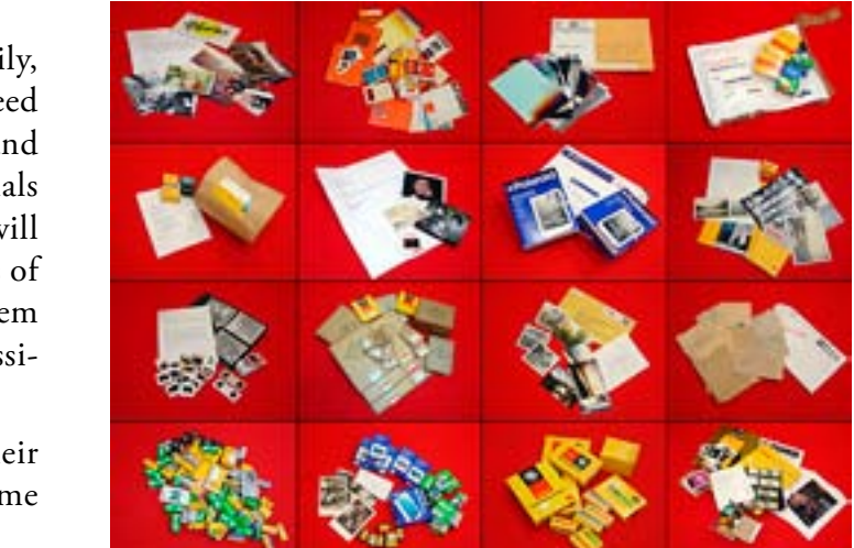
Examples of materials donated to the GCI Reference Collection by the public in response to the Getty's request for help in build-