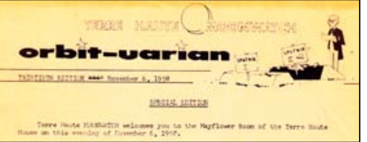
Weekly newsletter of the Terre Haute chapter of Moonwatch.