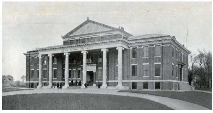
The Administration Building (now known as Good Hall) in the 1905-06 Catalog