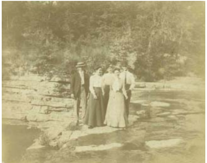
Unidentified group at Shades in southern Montgomery County

One of our principle objectives of our digitization effort was to make our photo collection -- our future image database -- searchable and accessible through the web. We decided to invest in our own web server along with DB/TextWorks to create all our databases and DB/Text WebPublisher to give them a web interface. These Inmagic products allowed us complete freedom in our design. Although WebPublisher does not have nearly as many features that the now mature CONTENTdm enjoys as a digital collection management product, it was affordable for us and continues to be so. In addition, it allowed us to publish our many non-image databases as we wished (such as our vital statistics index, our yearbook index, etc.). We have continued with these products up and soon plan to upgrade both our hardware and software -- for the first time in eight years -- in order to remain current even